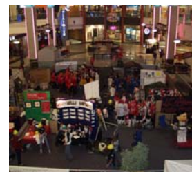
spirit, camaraderie, and enthusiasm at University of Alberta, GNCTR 2003

Teams from the University of Alberta and the University of Saskatchewan tied for the CIRCA award for the "Most Effective Use of Fly Ash in Concrete" and will share the $2,000 purse.