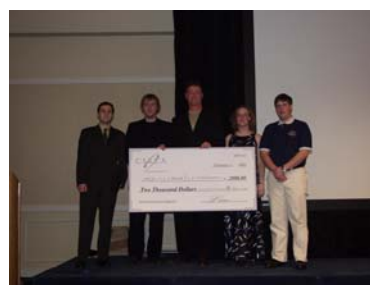
Right: Team Reps. from Univ. of Alberta and Univ. of Saskatchewan share the 2003 CIRCA Award purse.

The International Great Northern Concrete Toboggan Race has a rich history in the Engineering Community as well as within the schools that participate each year. GNCTR has been held annually at universities and technical schools across Canada since 1974, with competitors coming from Canada, the US and Europe. In 2003, the University of Alberta hosted 16 Canadian and US teams competing to create a structurally sound toboggan with a superior concrete mix design. GNCTR offers an excellent balance between Engineering Design Concepts, Concrete Mix Design, and Friendly Competition. For more on the GNCTR, visit www.gnctr2003.ca