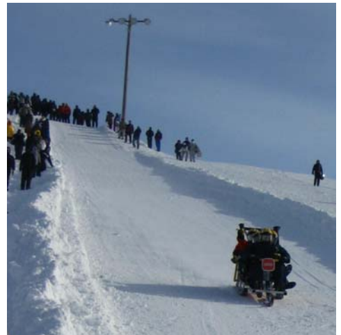
University of Waterloo's SLEDGO Team (above) blazed down its 1 st run. University of Manitoba hosts (below) recorded results and kept the finish line well groomed. ...Only in Canada.