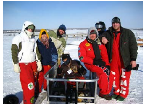
Hearty, cold and committed to their mission in sunny, -47° C temperatures. And not just this daring, McMaster University team...

GNCTR is a 33-year Canadian tradition CIRCA is proud to support.