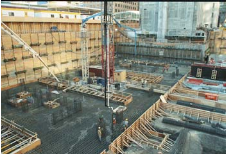
50% Fly Ash was used to reduce the heat of hydration of Calgary Courts Centre's concrete footing.