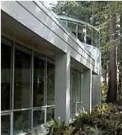
University of British Columbia's Liu Centre for Global Issues is constructed with recycled materials including high volume Fly Ash concrete.