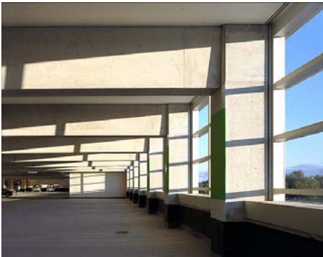
The fine, durable finish of York University's Student Services Parking Garage is attributable to the use of high volume fly ash concrete.

of our primarily concrete infrastructure is central to a robust Canadian economy. Since the "use of SCMs helps to produce more durable concrete" [9] in a more sustainable way, we are seeing the political will to follow through to realize the material and energy efficiencies sought by proponents of green building practice.