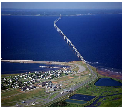
The 12.9 kilometre Confederation Bridge, completed in 1997, links Prince Edward Island to New Brunswick. Its 100-year design life was achieved with high performance, pre-cast, Fly Ash concrete mix designs.

In Canada, industry response to demands for more sustainable practice is demonstrated across market sectors, through initiatives ranging from revised practices [1] and specifications [2] to new programs [3,4] that support a greener future.